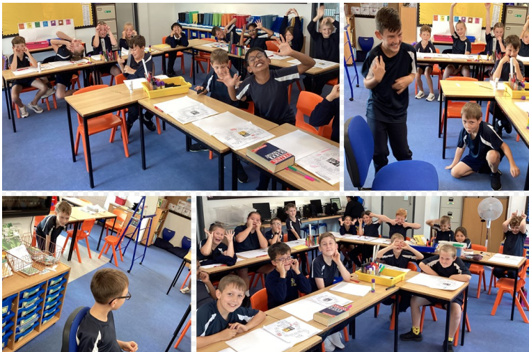
After a lively 'Story Whoosh!' reenactment of Man on the Moon (A Day in the Life of Bob) , the children transformed into some of the story's most mischievous characters.

This week the children looked at our new values: Enjoy, Belong, Believe and acted out how we might show those values.